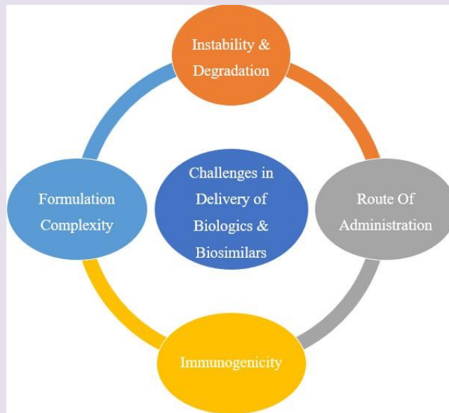
Figure 1. Different challenges in drug delivery